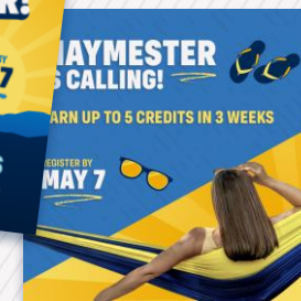
Social Media Posts